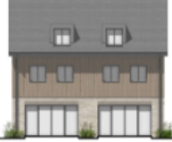
House 5 & 4 - South-East