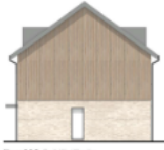
House 5.6.6 - South-West Develop